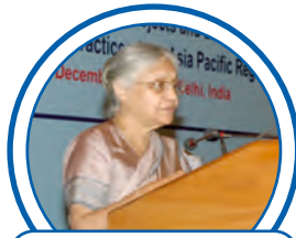
(2010) Chief Minister Smt. Sheila Dikshit