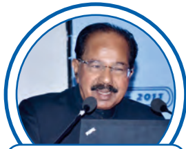
(2013) Union Minister Dr. MV Moily