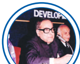
(1993) Bharat Ratna, Sh. Pranab Mukherjee, Former President, Republic of India