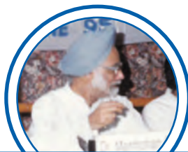
(1995) Union Finance Minister Dr. Manmohan Singh