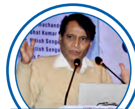
(2017) Union Minister Sh. Suresh Prabhu