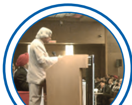
(2011) Bharat Ratna, Dr. Kalam Former President, Republic of India