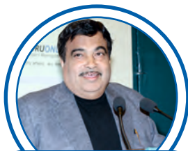
(2014) Union Minister Sh. Nitin Gadkari