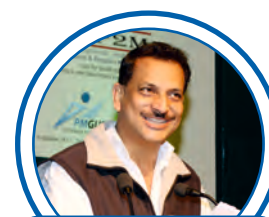
(2014) Union Minister Sh. Rajiv Pratap Rudy