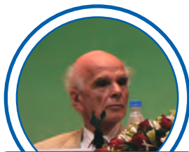
(2005) Founder of Club of Budapest Dr. Ervin Laszlo