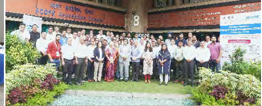
6 to 10 October 2025 in Delhi