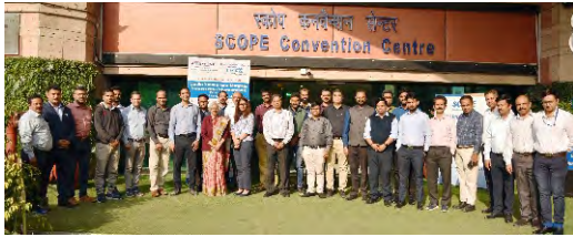
3 to 7 March 2025 in Delhi