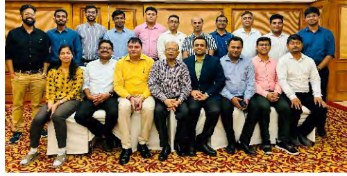
19 to 24 August 2024 in Mumbai