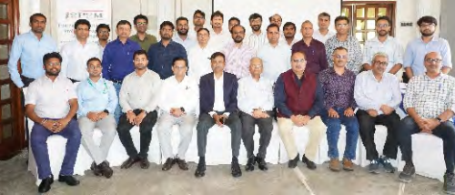
16 to 20 June 2025 in Delhi