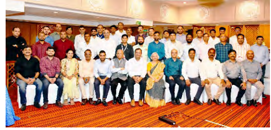
23 to 28 September 2024 in Delhi