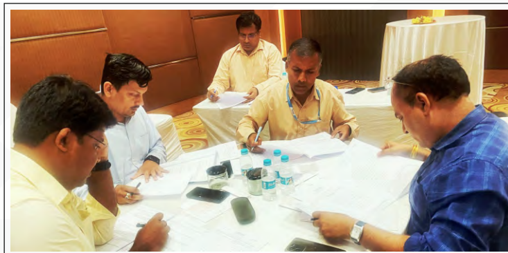
Some of the participants going through Certificate In Project Management(CIPM) Exam which is ISO/IEC 17024:2012 accredited

ISO/IEC 17024:2012 provides a framework for ensuring consistency, credibility, and quality in certification programs. By complying with this standard, certification bodies can demonstrate their adherence to internationally recognized practices and build trust among all stakeholders.