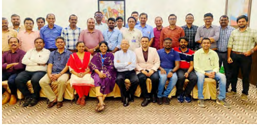
22 to 27 July 2024 in Bengaluru