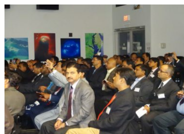
(2015) 16 participants from DRDO and 50 other participants from 20 companies at Goddard Space Flight Center (GSFC).