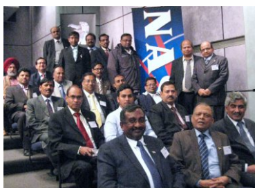
(2011) Beginning of our journey in giving the best possible executive education.