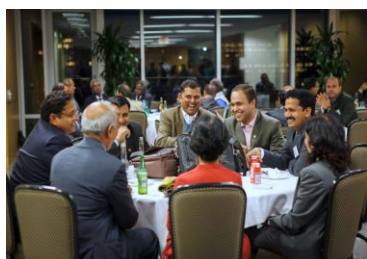
(2013) After hard work, time to relax over dinner.

13 October 2017 3.30 to 4.30 pm Feedback and Distribution of Completion Certificates by professors of GWU