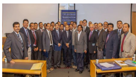
(2014) Group photo of the participants from Oil and Gas Sector.