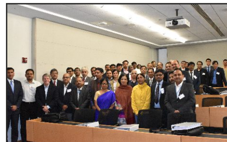
(2016) More than 50 participants who attended the 5 day program at GWU, USA are seen with the guest speaker from Government Accountability Office (GAO) and the director of IPA International, USA.