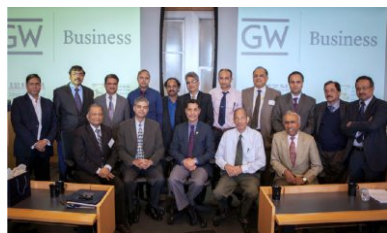
(2013) Some of the participants with the faculty of GWU.